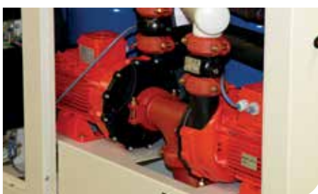
The integrated hydraulic package features all the necessary components: evaporator and condenser pumps, buffer tank, and easily removable water strainers.