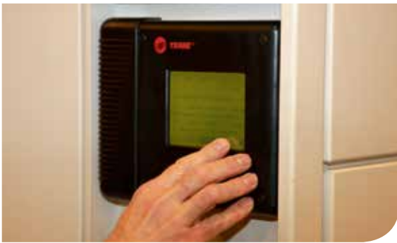
Touchscreen LCD display allowing easy navigation through various menus.

machine operation, the Trane AquaStream 2 will modulate system components to keep the chiller operating and producing chilled water, meanwhile continuing to optimize chiller performance.