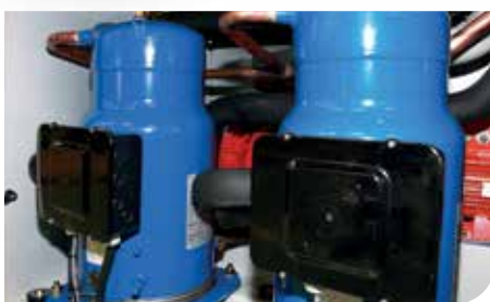
Reliable and highly efficient scroll compressors.